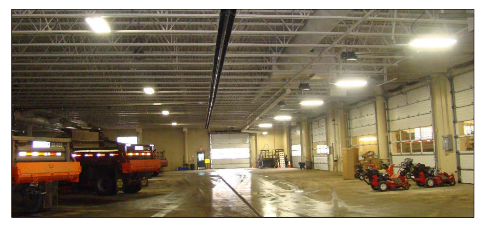
Truck Bay, City of Minnetonka Public Works Facility