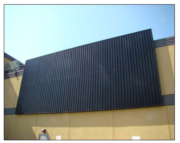
SolarWall® Minneapolis Third Police Precinct Building